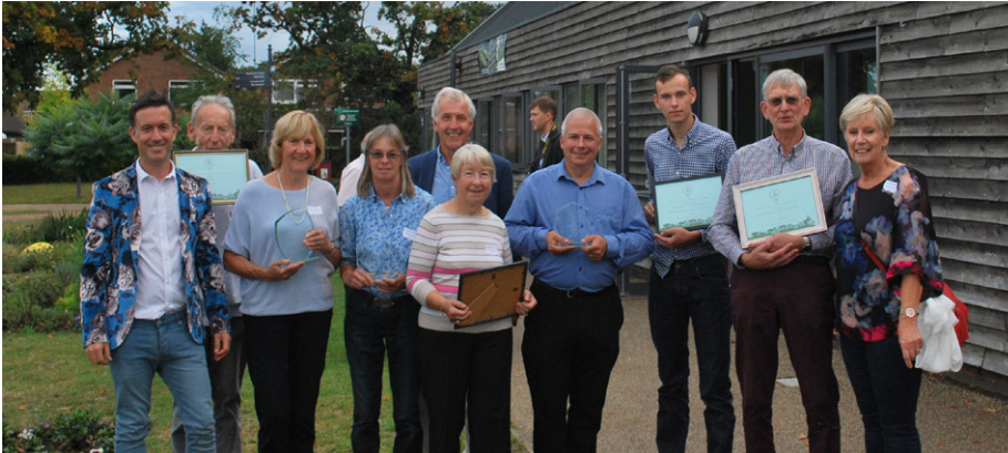
Members of the Bloom Team join Town Council staff at the regional awards ceremony in Woodley.