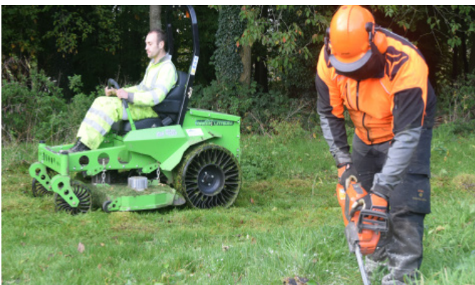
The Town Council Depot Team working within the Community

Electric mowers are lighter and easier to operate than petrol powered mowers so reduce mowing time. Electric mowers are virtually silent and reduce the hazard of fuel spills, with millions of gallons of gas spilled from lawn equipment each year. Not only are gas costs eliminated by switching to electric, but upkeep and maintenance costs are lower too.