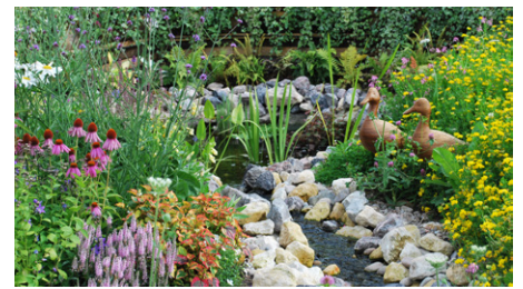
The Peace Garden- from construction to completion (left to right)