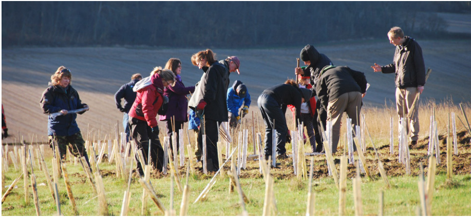
Community Tree Plant at Willow Wood

an integral part of our rural heritage as well as our ecosystem. Old orchards still contain ancient varieties which have otherwise died out elsewhere. They provide the right conditions for mosses and lichens to grow, which in turn offers a diverse habitat to attract a wide variety of birds, bugs, pollinators and other wildlife.