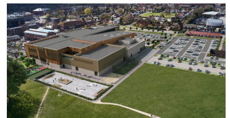
Update on Chiltern Lifestyle Centre; Page 5