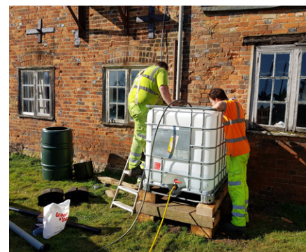
Resource Management: Water harvesting

Thanks to Serco, Amersham Action Group and Rotary Club of Amersham for helping to fund the trees and planters.