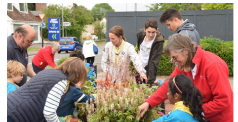
Bloom Awards; Page 4