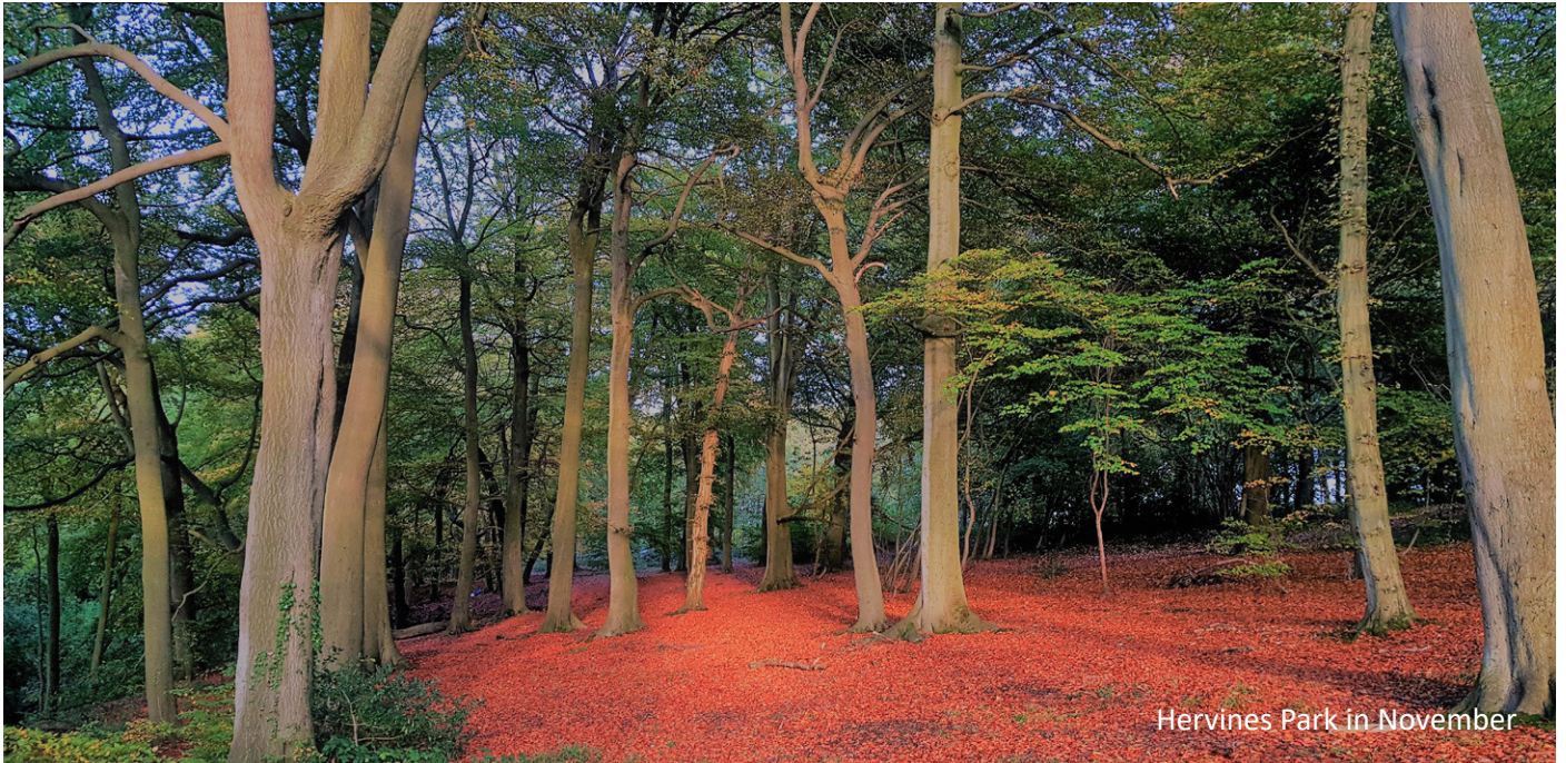
Hervines Park in November

EDITION 48: NEWSLETTER FROM AMERSHAM TOWN COUNCIL