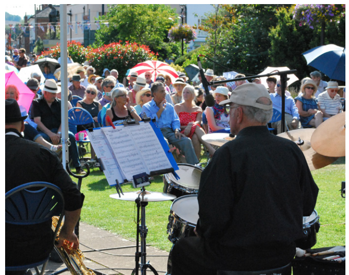
Refreshments are served from the Tea Hut in the Memorial Gardens during the band concerts and on Heritage Day

The new Council wants to know your views on what it should focus on in its first year. The survey is available at shadow.buckinghamshire.gov.uk/budget2020