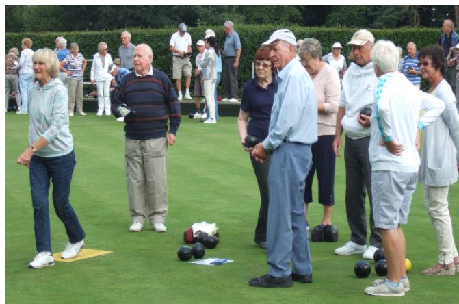
Hervines Park is the home of Amersham Bowls Club

Matches against other clubs, as well as internal competitions, are held frequently but those who want to play less competitively are also welcomed. The playing season is from April – September but an active social committee arranges monthly events throughout the year to encourage a friendly atmosphere and an inclusive approach.