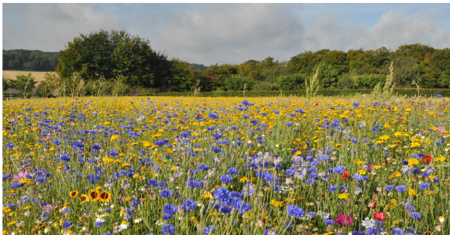
40% more wildflowers than in 2018

The Community Orchard is sponsored by Tesco 'Bags for Help', Amersham in