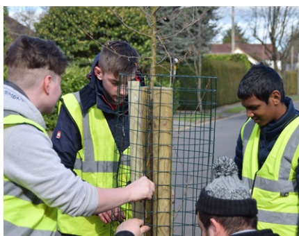
Working in partnership with Stony Dean School