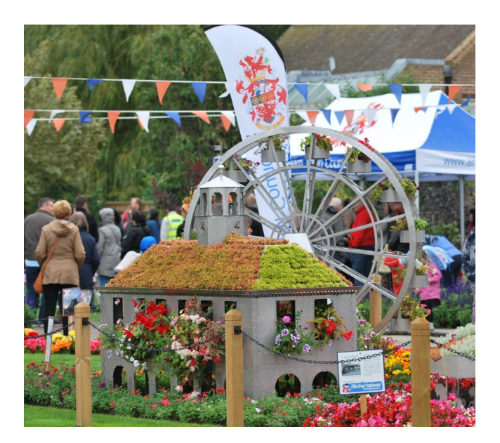
The wonderful funfair display in the Memorial Gardens

Needless to say that over spring and summer you will notice many further improvements throughout the town.