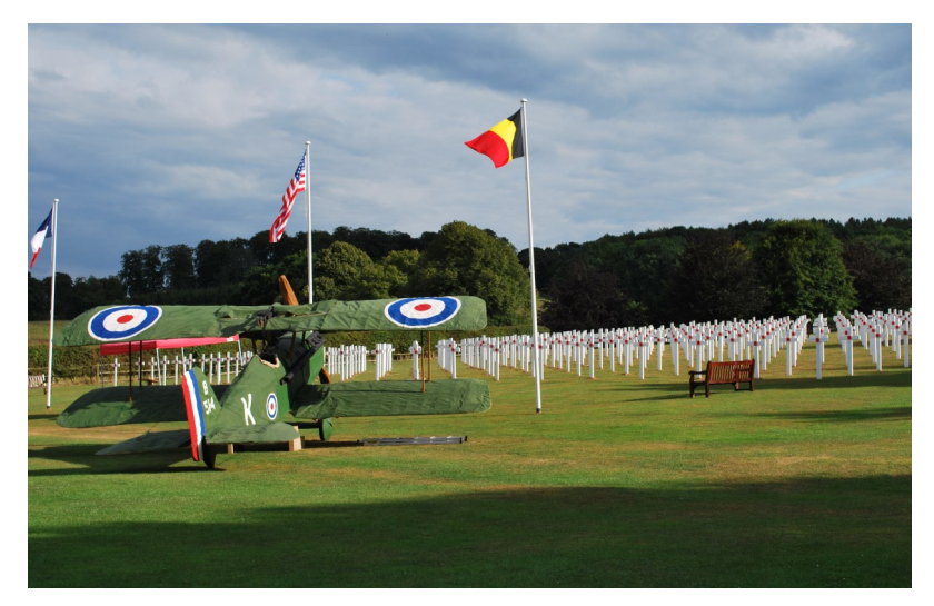
Amersham's World War 1 Centenary Commemorations in 2014

On 5 August we have somewhat of a first taking place in the Memorial Gardens— a play. Entitled The Glorious Madness this play gives a fascinating insight into the Great War, as volunteers, white feathers and heroes are brought back to life in story and song. All events in the Memorial Gardens are free.