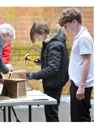
ean School help to make bird boxes

ocket of green epitomises Bloom and how the initiative servation and biodiversity munity engagement. In ritage fruit trees you will find ative bulbs, areas of native ug hotels (right photo), a pond, wood carvings and mmed with pollinators. This dlife haven also ticks the agement box with a newly compost bin and water butt!